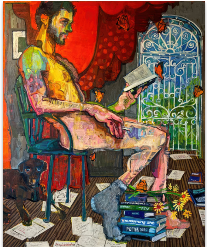
Annotated Nabokov (2023) oil & oil pastel on linen, 240 x 200 cm