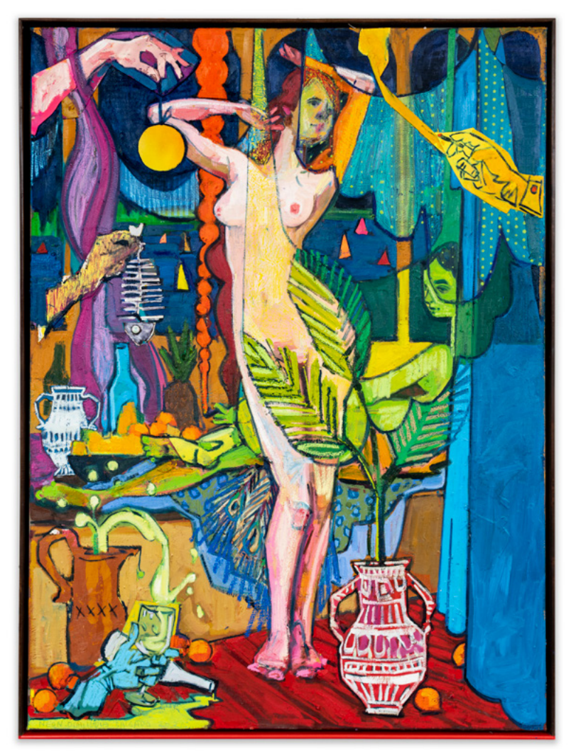
Neon Odalisque (2020). Oil, pastel, and mixed media collage on linen. 155 x 120 cm (bespoke frame).

I have been polemic, subversive, political, and outspoken in the past but I tired of that; I wanted to be Romantic. Playful...But these works also evoke sensations of seduction, mystery, warmth. Given the uncertainty and confusion this year, I just allowed myself to float into something fantastical – a land of make-believe. There's something reassuring but also disquieting about the works. Esoteric. Codified. Something 'just a little bit off'. In that sense, they retain mystery for me as well.