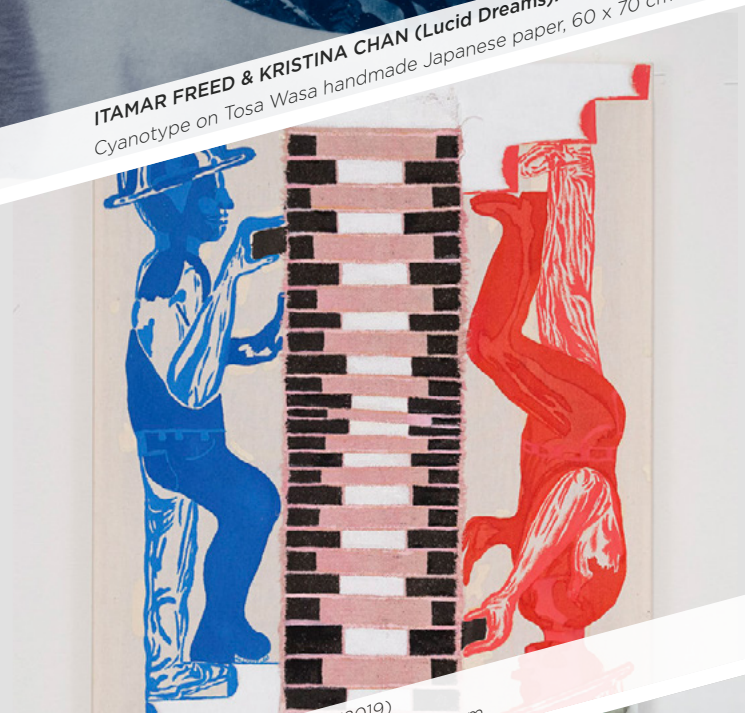
MILES DEBAS: Bricklayers (2019) Ink, acrylic and collage on muslin, 41 x 31 cm