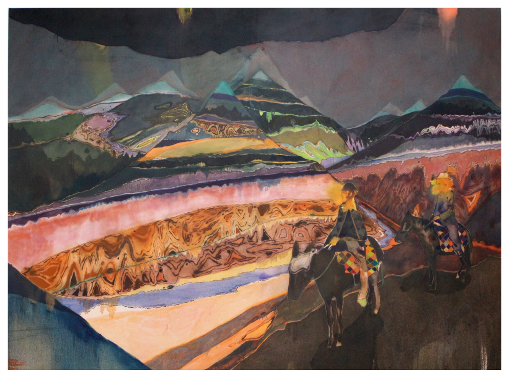
These Days Foretold (2015), Oil and Synthetic Polymer on Canvas, 186.5x251.5cm

Private View: Thursday 5 November 6-9pm Exhibition Dates: 6 November - 19 December, 2015