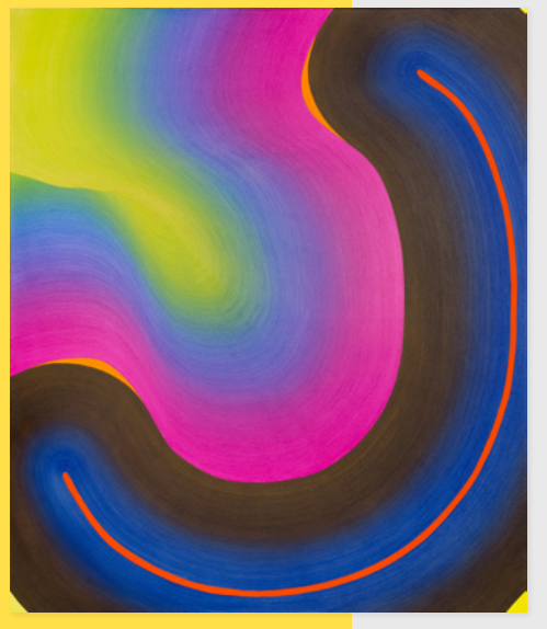
Clown (2024) oil on canvas, 147 x 122 cm

We warmly invite you to view the works in advance or in person. Kobayashi's exhibition opens with us in London on Thursday 17 October 2024.