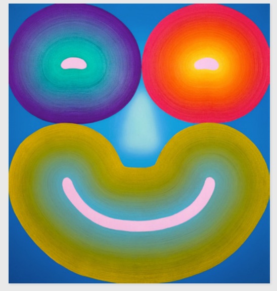
Clown III (2024) oil on canvas, 81 x 76 cm