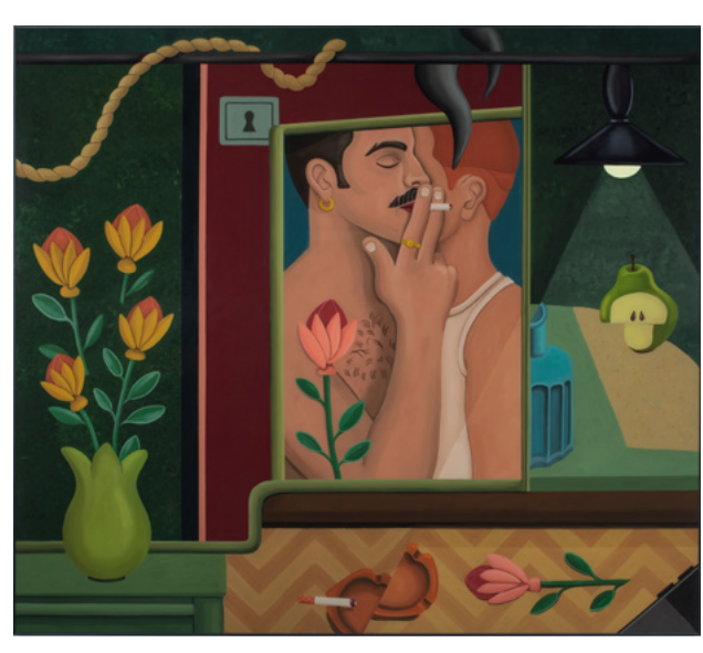
Gori Mora: Study of a living room (2022) Oil on perspex 145 x 160 cm