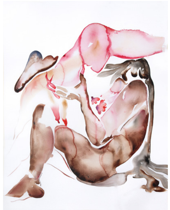
WYNNIE MYNERVA: All Body Weight (2021). Watercolour on paper, 105 x 75 cm.