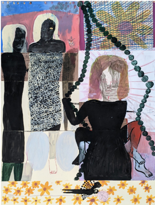
DAVID NORO: Three (2021). Acrylic, ink and collage on paper, 200 x 140 cm.