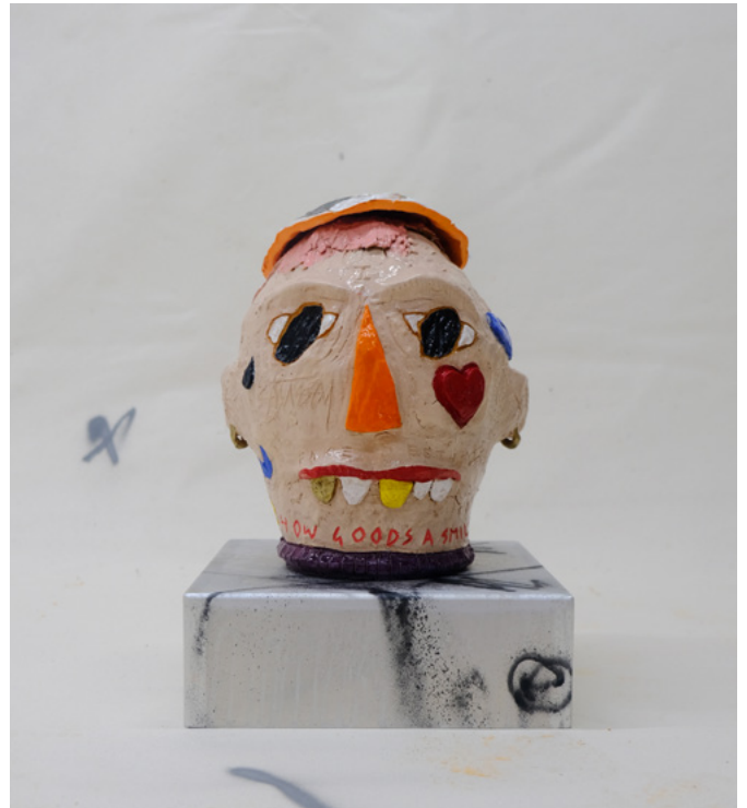
Saxon Quinn, Geezer (2023) Clay, glaze & aluminium plinth, 35 x 25 x 28 cm (sculpture) / 10 x 30 x 30 cm (aluminium plinth)

PREVIEW: THURSDAY 30 NOVEMBER 18H30-20H30 EXHIBITION: 1 DECEMBER - 20 DECEMBER 2023