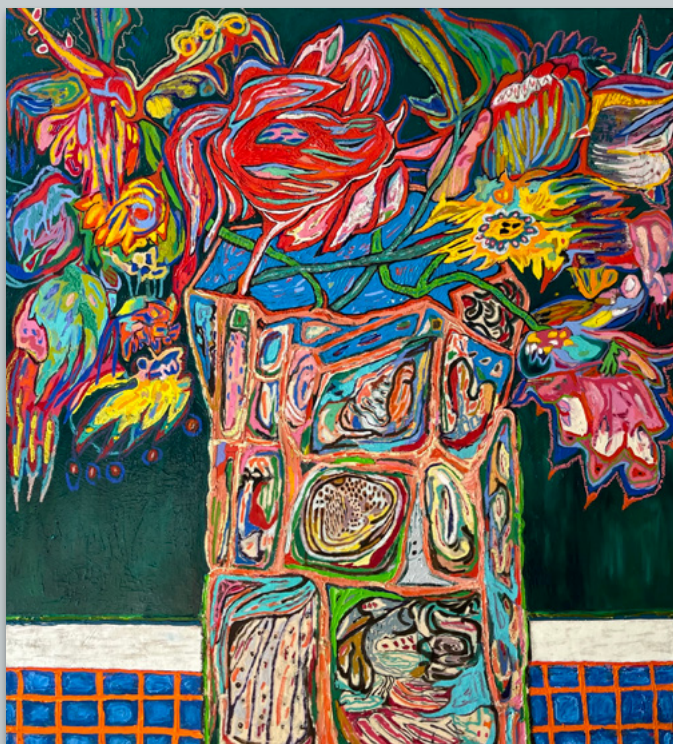
Ksenia Dermenzhi, Flowers On The Checkered Tablecloth (2023) Oil, oil pastel and fabric on canvas, 150 x 135 cm