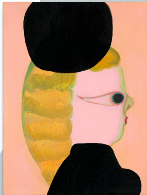
Christina Zimpel, Finger Wave (2023) Oil on linen, 40 x 30 cm