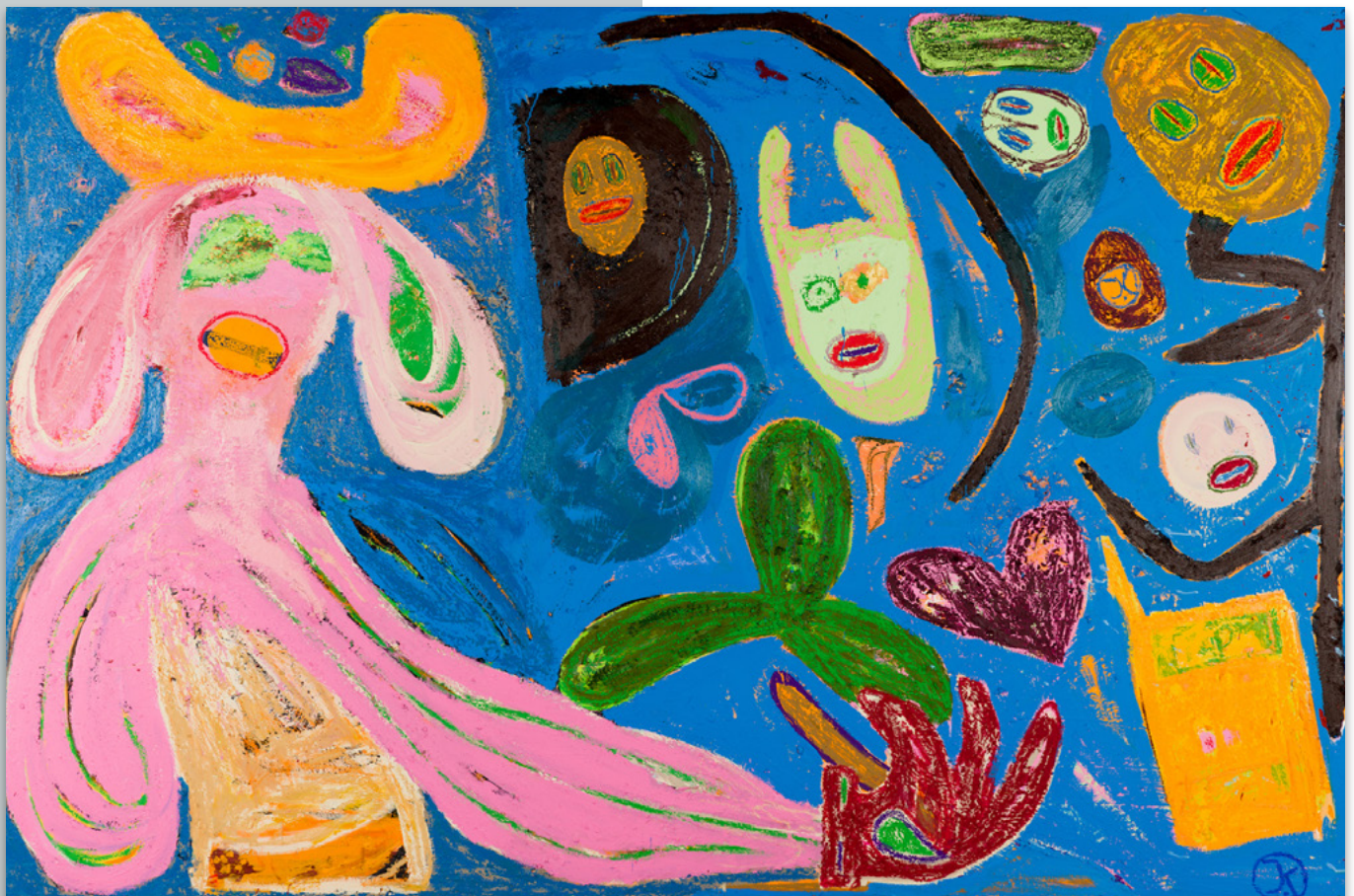
Jack Kabangu, Market Trip (2023) Mixed media on canvas, 200 x 300 cm